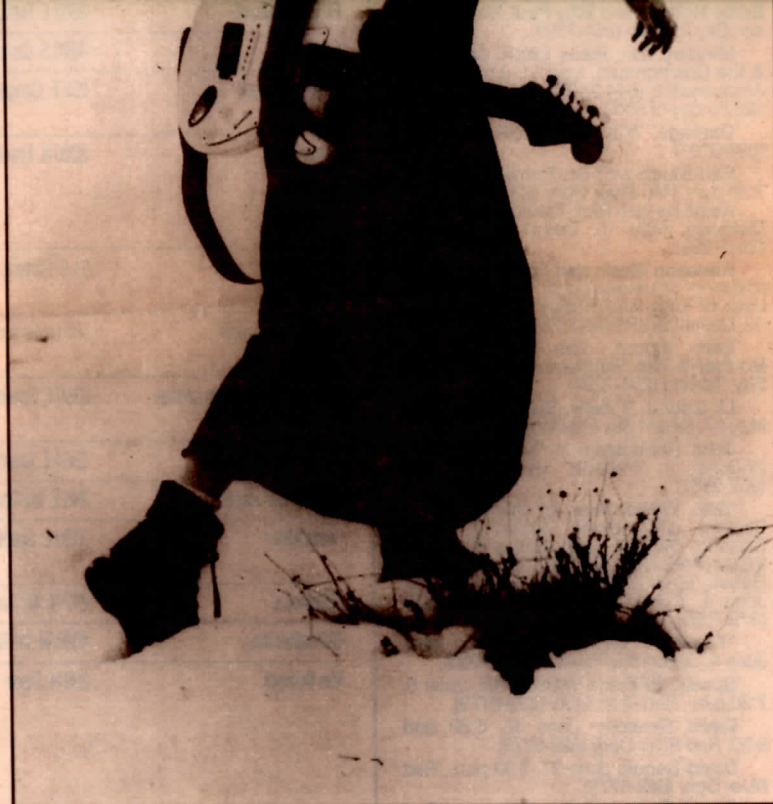
When Mercury Records left her out in the cold, Michelle Shocked took the label to court - and won.

But what's she's really looking forward to these days is starting a family. Remember her line in the tune "Anchorage," the one about being "anchored in Anchorage"?